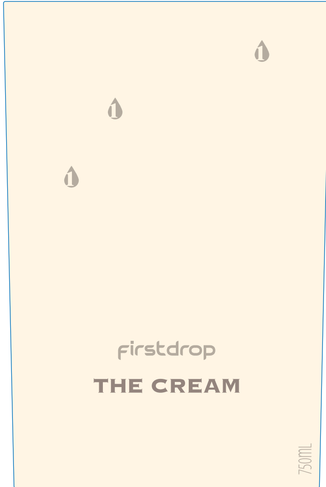
Overall 125mm x 84mm